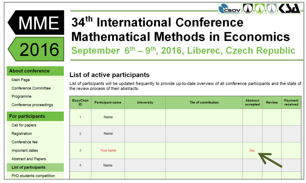
Figure 2: Abstract accepted