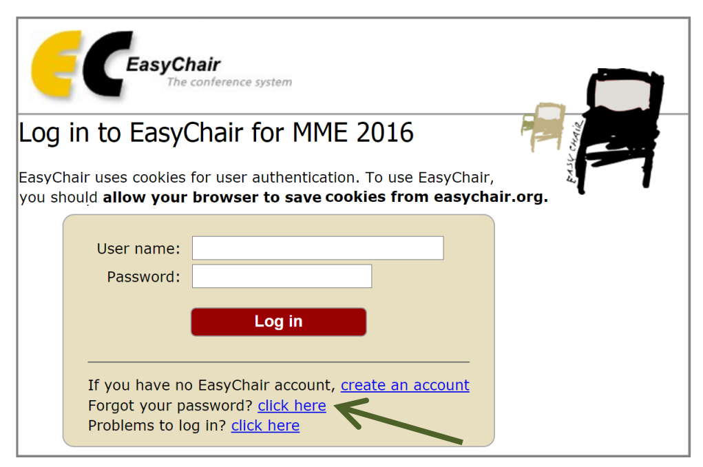
Figure 1: Log in to EasyChair for MME 2016